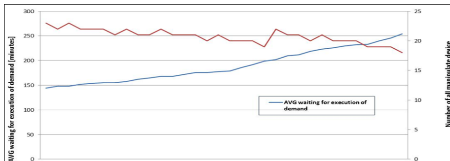
Figure 2. Contradiction of optimization criteria

A compromise between both contradicting criteria, see Figure 2, can be called the point of balance. The balance point in this case is understood as a generic term. A preview of an intersection of the two criteria is also shown in Figure 2.