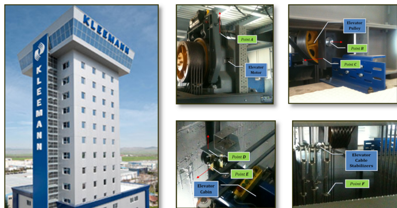
Fig. 2. WelCOM Testbed Planning

The development of WelCOM’s mobile client drives an assessment of direct and indirect methods for inferring maintenance related contexts. One of our main tested sites is the Kleemann’s lift testing tower. This tower is equivalent to a seventeen floor building, and comprises four testing units. The WelCOM intelligent advisor should be able to monitor, map and analyze a set of condition parameters related to lift operational parts and components (Fig. 2). The lift testbeds themselves are technical structures composing an integrated lift machinery installation.