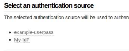
Fig. 5. Linked untrusted IdP as the authentication source in the proxy IdP.