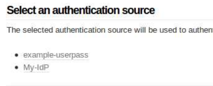
Fig. 5. Linked untrusted IdP as the authentication source in the proxy IdP.