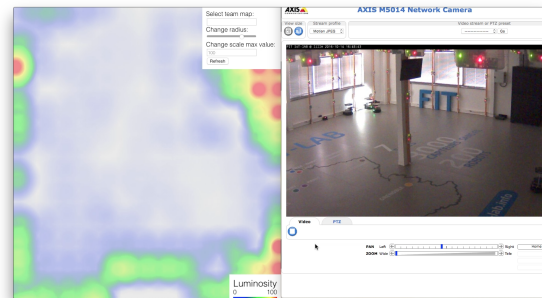
Figure 3. Heatmap web application and real time stream from the Lille site.

To illustrate the capabilities of IoT-LAB, we will run an experiment on the Lille testbed, with live monitoring of luminosity and performance metrics. The nodes perform low-power data collection using Orchestra [4], an autonomous scheduler for RPL+6TiSCH networks. We use the Lille testbed's remote light controller to vary luminosity at runtime. A Web application retrieves light sensor data from the