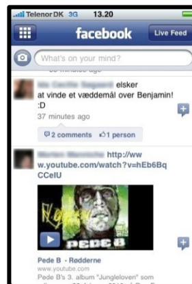
Fig. 1. Example of probe response picture

From an analytical perspective, the Mobile probe method objective was not to reach a single unambiguous answer or solution, but rather the responses should let the researcher become inspired by the participants [1]. With the aim to support the project's rigidity in the analysis phase, while keeping a user-centric focus, user experience goals and cognitive process variables were applied to the analysis. The cognitive processes were identified as: attention, perception & recognition, memory, learning and problem-solving, planning etc. The user experience goals were identified, as: satisfying, enjoyable, provocative, boring, etc. (All derived from [9]).