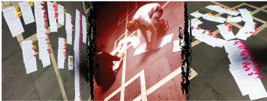
Fig. 4. Bodily engagement into the collaborative analysis

Mobile probing is a method that by explicit choice is digital. Nevertheless the analysis process makes use of a physical representation and handling / re-coding process; a process that takes place after all mobile probes are collected. Good network views are available in digital analysis tools as Atlas.ti, but the bodily engagement and collaborative dialog while doing so was prioritized here. Soon, technologies may support the analyst in an acquiring equally sense of the data, but for now this was a very adequate process.