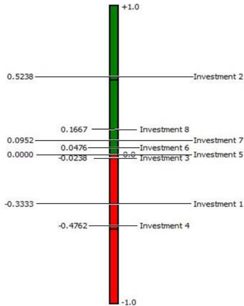
Fig. 1. The PROMETHEE II complete ranking

In the Table 5 PROMETHEE Flow Table we can see Phi, Phi+, Phi- score. Investments are ordered by PROMETHEE II complete ranking. The positive flow expresses how much an alternative is dominating the other ones, and the negative flow how much it is dominated by the other ones.