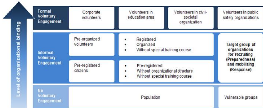
Fig. 1. Classification of target groups for disaster prevention, coordination and mobilization of volunteers.

The types of volunteers shown in Fig. 1 differ in regard of their degree of binding to an organization. Pre-registered citizens are characterized by their general willingness to participate with focus on a less-formal organization structure and no special training for crisis response. They would be willing to register themselves on a platform, but they don't want to become member of an organization. Pre-organized volunteers are belonging to another category of voluntary group. Although they are not specifically trained and are dedicated for case-specific assistance like the pre-registered citizens, they seem less reluctant for joining an organization. With the introduction of these two analytic categories we can better assess and address the needs of different target groups of informal volunteers, which were formally subsumed under broader categories such as "spontaneous volunteers". The new concept of crowdtasking described in chapter "The concept of crowdtasking" is addressing both types of informal voluntary engagement (pre-registered citizens and pre-organized volunteers).