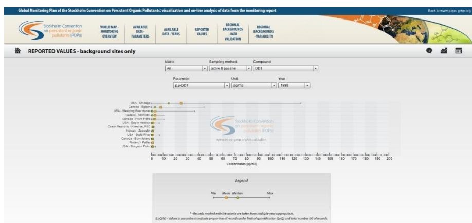
Fig.2. On-line data visualization of GMP data – tool 4: reported values. Available at www.pops-gmp.org .

The visualization tools were developed using Adobe Flash and ArcGIS technologies. The user-defined outputs are available for download as a graphic file (PNG format); the underlying data from tools 4–6 are also available in text format which is easy to import to MS Excel.