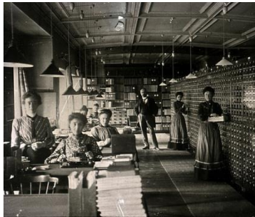
Figure 3: The Universal Bibliographic Repertory, Brussels, 1910

Paul Otlet, who is recognised as the father of documentation, was the first to conceptualise and devise a classification tool which digitised access to knowledge. Considering the notion of information as independent from its medium but also the need to come up with powerful means of transmitting this information, he created blueprints for many systems between 1900 and 1935, each more visionary than the next. As a result, Paul Otlet left us with many drawings and descriptive notes of what technology would become a century later: the video conference, the conference call,