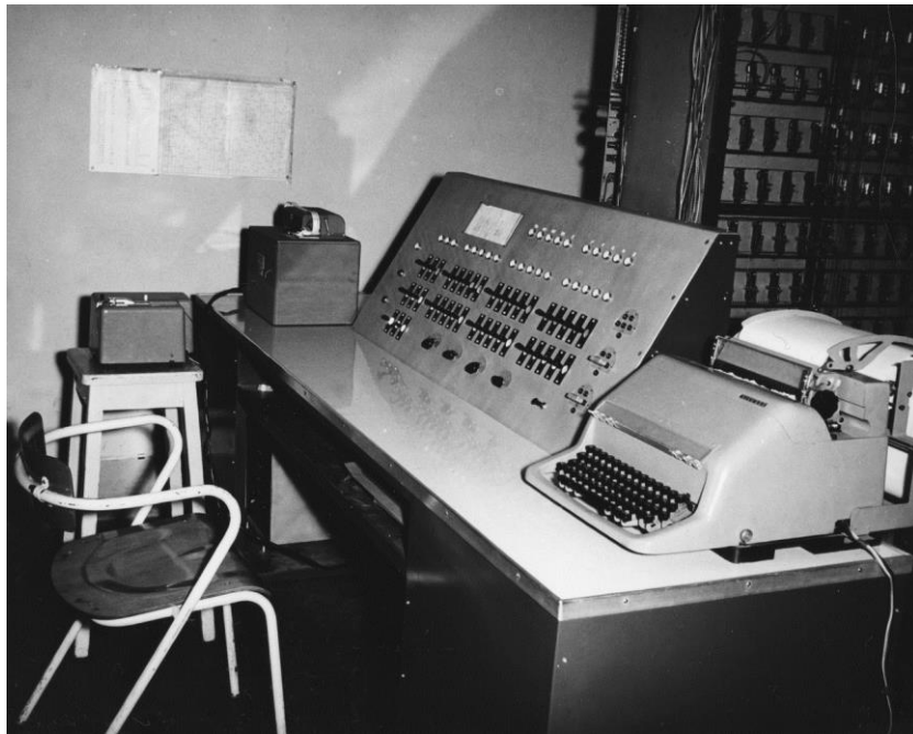
Fig. 1: The only surviving photo of the Manual Control Panel of the 1957 MR.

A detailed discussion of the problems faced by HMR in the rebuilding of the MR is in [8], while in [18] the use of the simulator of the 1956 MR for the “restoration” of its system software is presented. In the following we focus on the use of the 1957 MR simulator in the teaching workshops held at the Museum. The virtual MR is used to revive the look and feel of an old computer and to show and discuss some of the principles and mechanisms according to which past and present computers work.