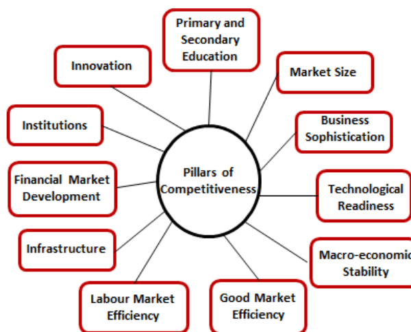
Fig. 2. Pillars of Country Competitiveness

The authors consider that the competitiveness of a country is a key determinant for organisations to select an appropriate country for outsourcing and offshoring. However, although the competitiveness of a country stimulates outsourcing/offshoring activities and attracts foreign direct investment (FDI), the researchers consider that not all the eleven factors have the same importance or consideration while taking outsourcing or offshoring decisions. Hence this paper analyses and discusses the influence of top four factors important from the outsourcing and offshoring decision’s point of view. The factors which the authors concentrate on are shown in the Figure 3.