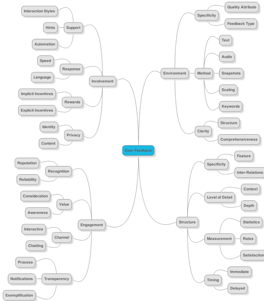
Fig. 1. Focus Groups Final Thematic Map

Engagement refers to the key merits the acquisition process provides to the involved users that encourage them to take part as evaluators. This includes some key characteristics of engaged users with the process, and also the qualities that are important to the process. This includes Recognition, Value, Channel, and Transparency. In details, participants mentioned that they would like to be recognized through their reputation . Reputation may be considered as a component of identity as defined by others. Reputation is a vital factor in any community where trust is important. Also, users would take recommendations, and/or solutions into consideration if they are given from reliable users. The reliability of users increases the weight of their feedback. Moreover, users like to be valued in a way in the participation. Participants mentioned that their feedback is valued by knowing that it