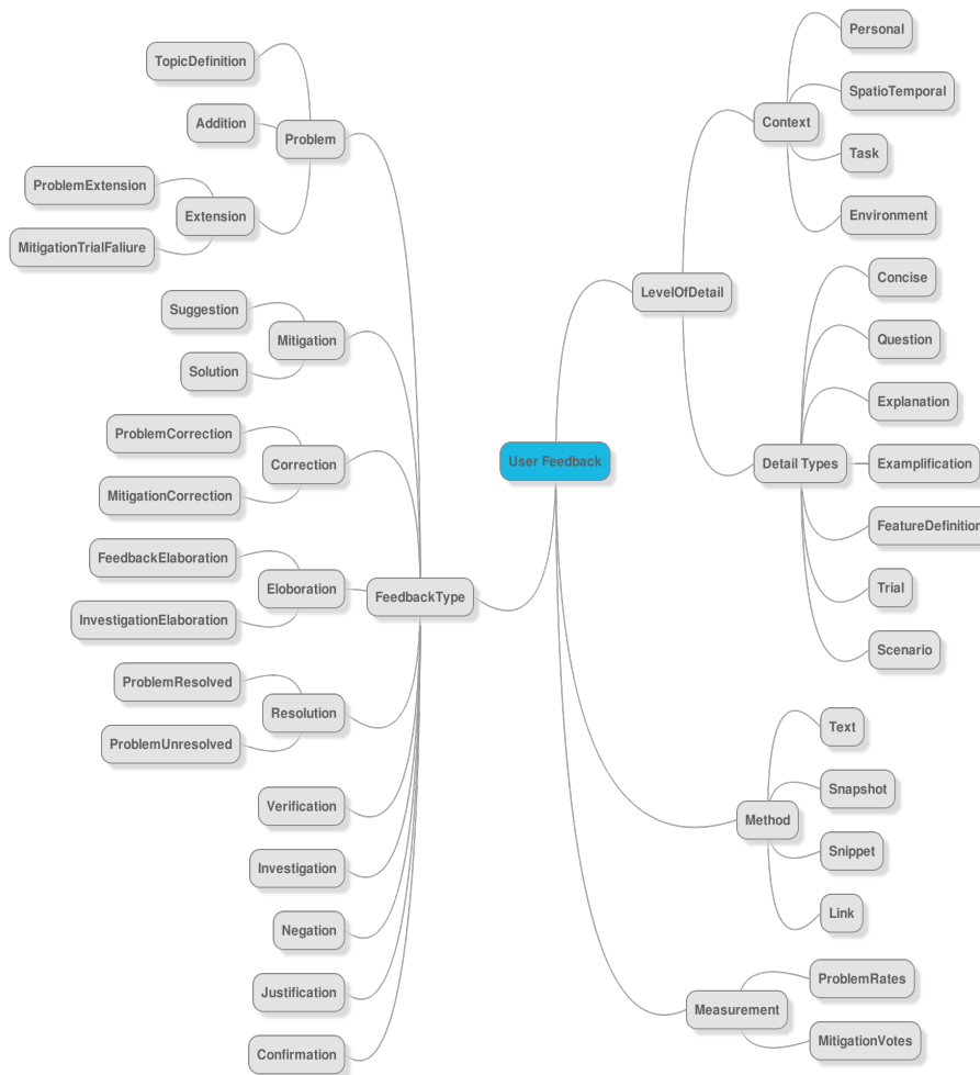
Fig. 2. Forums Analysis Final Thematic Map

This means that a feedback thread may contain multiple problems along with the replies. From the definition of this feedback type as a complex type, this implies that it must contain other feedback types in its definition, which in this case are Confirmation or Negations that must reference another problem. Therefore, it cannot reference a feedback post that contains Mitigation, because by definition we use this feedback to add a problem to a problem.