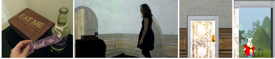
Fig. 2. The virtual room and characters. (a)The physical objects (b) User inside the CAVE (c) VR door with interactive doorknob (d) White Rabbit in the Garden