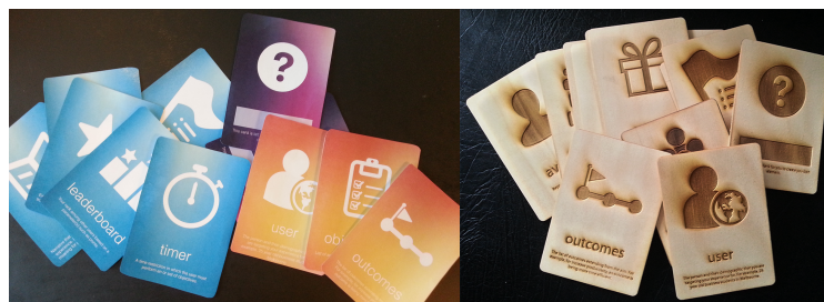
Fig. 3: Paper (left) and wooden (right) prototype.

These cards can be used for any other elements that the designer wishes to incorporate as part of the gamified approach.