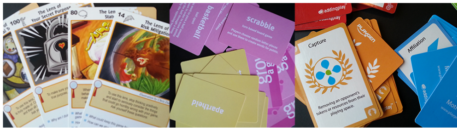
Fig. 2. (From left) Schell's deck of lenses, Grow-a-Game, PlayGen Deck.

centrated resource for the design of gamified approaches aimed at both inexperienced and experienced designers. These resources provide support and assistance, while being diverse and open to many possible design options. While having the freedom to design any type of gamified approach can be a positive thing, it may become overwhelming to an inexperienced designer. Furthermore, if the design is based heavily around extrinsic and/or meaningless rewards, it may harm the longevity, user motivation and engagement with the gamified approach [11], [12].