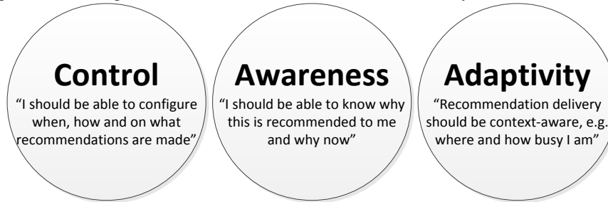
Figure 2 Three recommendations for human-centred recommendation delivery

Based on the results from both phases, an initial list of recommendations are worth to be noted when engineering the recommendation delivery. Figure 2 presents succinctly the three macro recommendations which could also be seen as research challenges for the design of human-centred recommendation delivery.