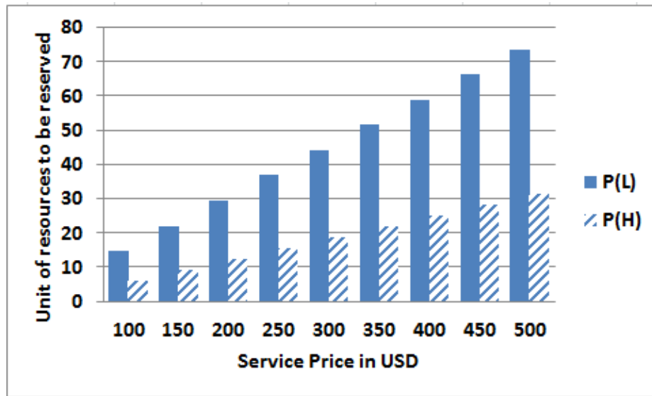
Fig. 1. Resource prediction for different types of customers, according to different services.

Figure 2 shows the premium amount to be paid, according to service type. Premium amount is shown on the top of the bars, in USD, while the values at the bottom represent the total price of services, in USD. Premium amount of each of the 9 services is shown.