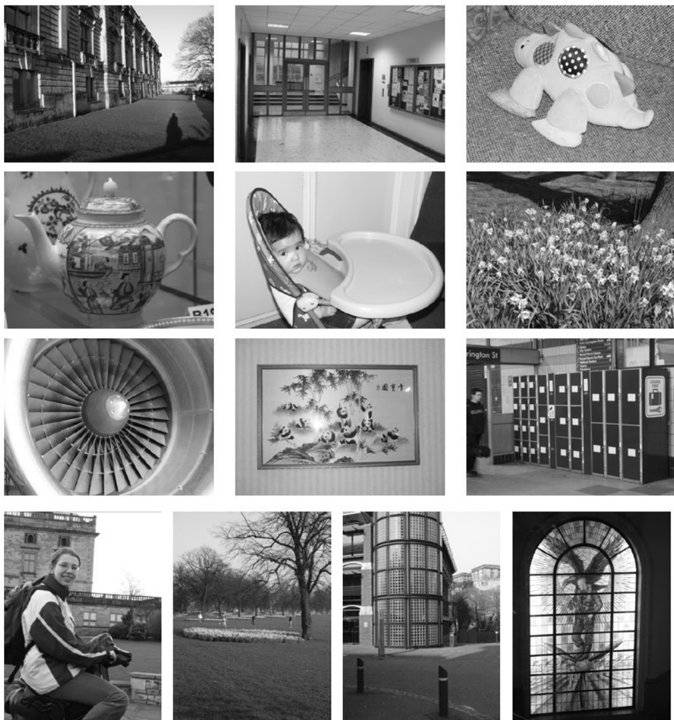
Fig. 3. Examples from UCID for testing.

All the images are categorized to Condition A, B, and C as following rules: 400 images are selected as cover images, which are not processed by any compression or data hiding; other 469 images are compressed by traditional VQ with randomly selected codebook size; and the rest 469 images are applied Yang et al.'s method, also with randomly selected codebook size and full embedding. The secret message is composed of '0' bit and '1' bit generated randomly. The output result of applying our steganalysis method for each image is either Result A, Result B, or Result C. The number of various results for the UCID test images are shown in Table 1. The thresholds are set to be T_F = 1/3 , T_S = 5 , and T_R = 0.7 .