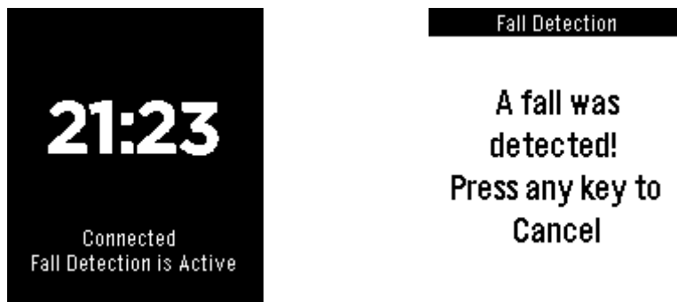
Figure 3. Screenshots of the Pebble Smart watch Application in case of an idle active connection and in case of a detected fall

As the Pebble display shows the time, the developed application checks whether an active Bluetooth (BT) connection with the android device is established. If a connection is found, the smart watch transmits the current accelerometer data and the corresponding time stamps. In the case for some reason the Pebble smart watch is disconnected from the android device (for instance, it gets out the BT range), the Pebble application changes the visible status connection, closes the accelerometer, stops transmitting data and notifies the user with a small vibration about the change in the status of the connection. The user has to be notified immediately about the disconnection. Once reconnected, the application starts again automatically.