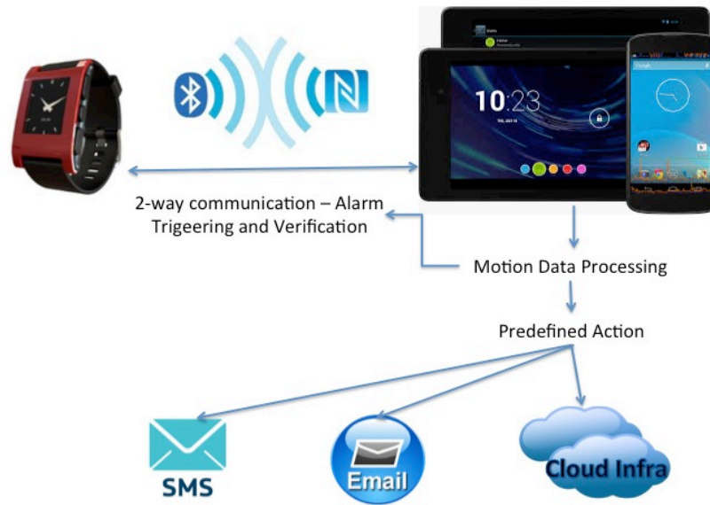
Figure 1. Architecture of the proposed fall detection application

The goal of this work is to propose an unobtrusive wearable system capable of capturing and analyzing motion data and reaching a prompt decision for activity recognition and fall detection. For this purpose, the Pebble smart watch [5] has been utilized, as it combines several positive characteristics (low price, water-resistance, user friendliness, long battery life, open SDK). The specific smart watch has a reliable built-in accelerometer to measure human movements, and a personal area network interface in order to transmit data and communicate with other devices. More details about the Pebble device are provided in Section 2.2. The processing of the motion data occurs in a nearby Android device, since the smart watch lacks the necessary computing power to perform data analysis and the wide networking interface for transmitting the fall detection information. The overall architecture of the proposed fall detection application is illustrated in Figure 1.