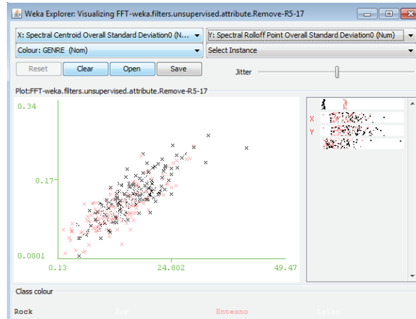
Fig. 3. Visualizing Centroid and Rolloff for genres Rock and Entexno.