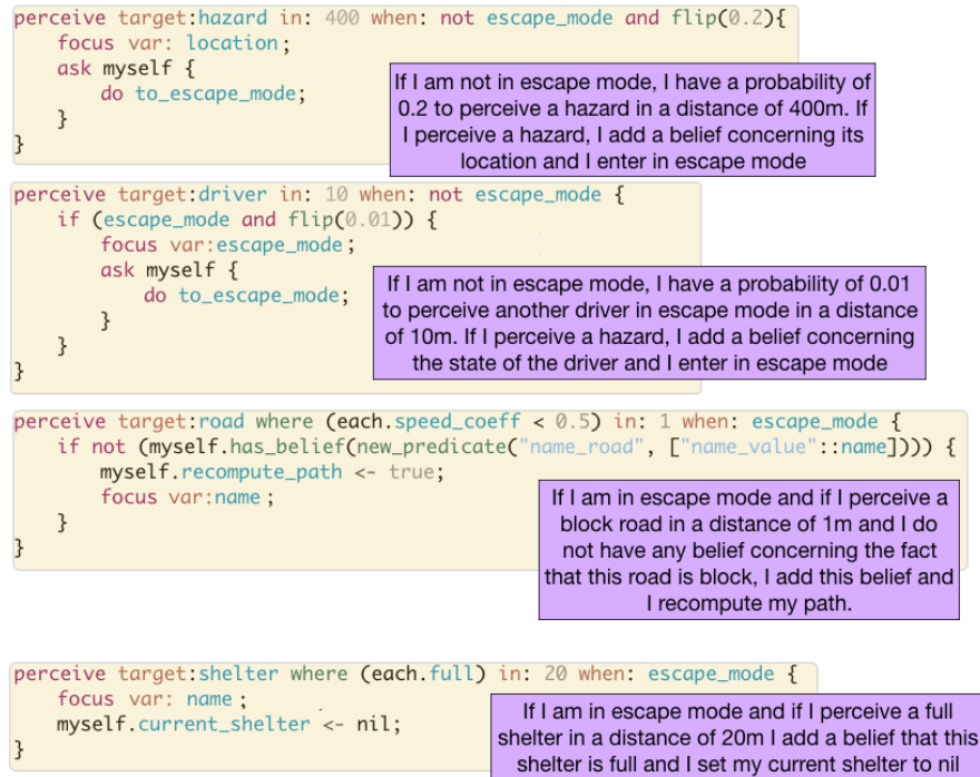
Figure 9. Possible solution GAML code for the driver perceptions

to define the behavior in a simpler way, avoiding to write many complex reflexes. Only one modeler mentioned that they preferred the reflex architecture as they were more used to it. The last two participants did not answer this question.