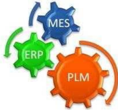
Fig 2: Functional Areas of I.T. Enterprise Architecture. The figure shows the three integrated areas of Product Lifecycle Management, Enterprise Resource planning, and Manufacturing Execution Systems [6].