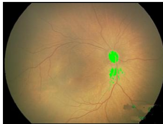
Figure1. Retinal image with candidate optic disc marked with green color

1000 but less than 10000 pixels. Clustered those pixels whose intensities are equal when divided by a certain histogram bin width which in this paper is 10, and sort the clusters according to the intensity. Start from the cluster with maximum intensity and check the number of pixels in it, if the number is less than 1000, then go to the next cluster in descending order of intensity until the number of pixels is between 1000 and 10000, and the intensity range of this cluster is determined as the threshold T . Those pixels whose intensities are brighter than the threshold are marked as candidate optic disc with a green color (0xff00ff) as shown in Figure1.