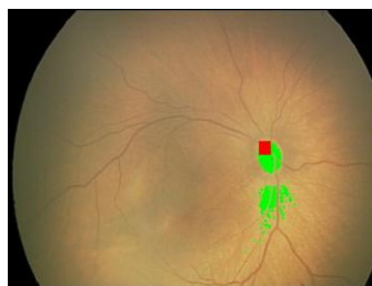
Figure2. The result of automatic localization of the optic disc with a rectangle

As shown in Figure1, there are some regions marked with green color which are not real optic disc, to eliminate the false candidate pixels, morphological erosion is applied on them. Find all the start positions of the candidate regions, structure element structElem begins from these positions and tests all the candidate regions so as to find a region which can include it. Figure2 shows an instance of the localization result.