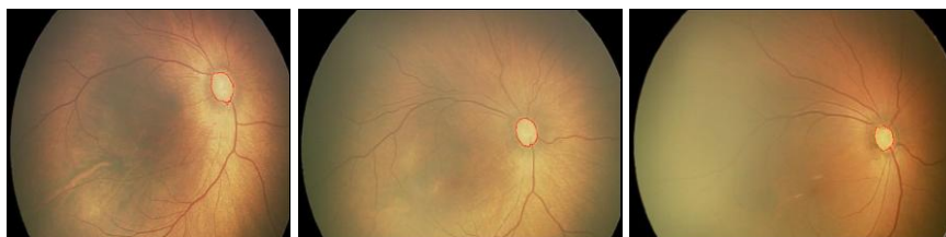
Figure4. The optic disc edge results with the third feature added.