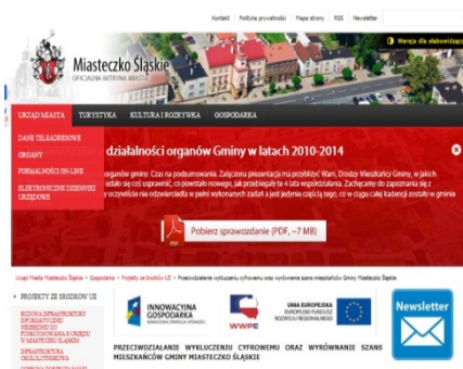
Fig. 6. Portals of Silesia agglomeration with exclusive quests

The problem of supporting exclusives is very important in Silesia region. During transformation starting at the beginning of 90's in Poland many miners and workers of heavy industry lost their jobs. So the problem became very important also for local governments. The content of the selected Silesian cities portals: Jastrzebie Zdroj, Wodzislaw Slaski, Gryfow Slaski oraz Miasteczko Slaskie reflects the typical approach to “excluded” people; actually on these portals habitants may find basic information about exclusive phenomena presenting some initiatives and projects. Therefore the idea of development KPE seems to be very natural.