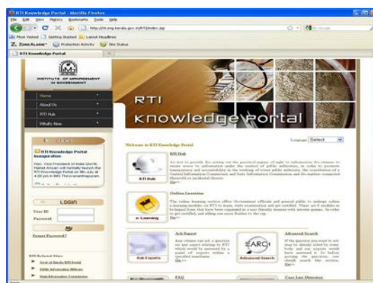
Fig. 2. An example of RTI Knowledge Portal

One of the oldest knowledge portals is presented in Fig. 2 (see: [19]). Main functionality of the portal concerns to co-operation with experts, e-learning offerings, Case Law Directory apart of typical FAQ (frequently asked questions) capabilities.