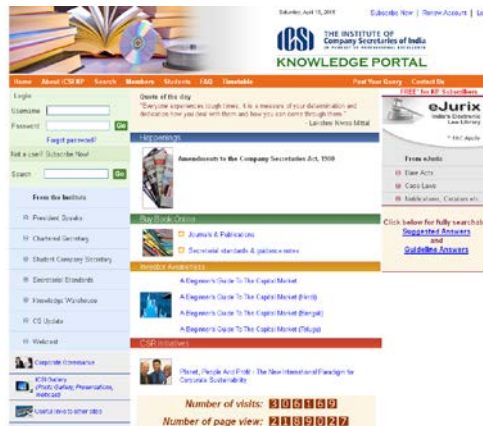
Fig. 3. ICSI - Knowledge Portal

Next presented KP is ICSI Knowledge Portal (ICSI-KP) “a capacity building initiative of the Institute of Company Secretaries of India (ICSI) for its members and students is a reservoir of knowledge enabling the users access to huge pool of information including Bare Acts, case laws, notifications and circulars issued by Government and regulatory authorities from time to time” – description available from eJurix on the ICSI KP home page Fig. 3 [23].