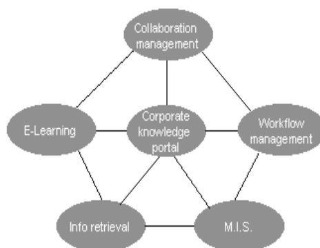
Fig. 1. Elements of Corporate Portals

Going further - Corporate Portal – can be defined as an integrated user interface, developing websites, and for the exchange of information, knowledge management in the company and the implementation of various business transactions. This is a point of access to all information resources and applications used. It integrates systems and technology, data, information and knowledge to function in the organization and its environment, in order to allow users a personalized and convenient access to data, information, knowledge, according to the tasks arising from their needs, anywhere, anytime, in safe manner and through a single interface. More advanced portals act as powerful workplace to ensure collaboration and exchange of documents. Fig. 1 [24]