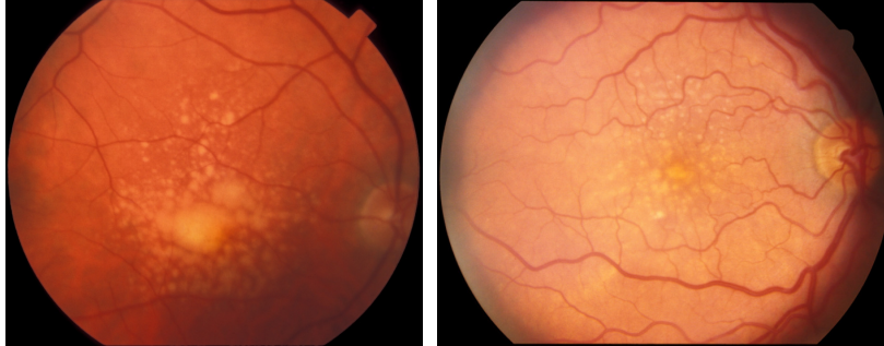
Fig. 1. Retinal images containing drusen. Drusen are the yellow brighter spots on center of the image, having the optic disk on their right side.

graders. The objective was to produce a reference dataset of retinal images graded by experts, which could be used as the ground truth of any automatic quantification technique. In our case, it was used by the AD3RI methodology.