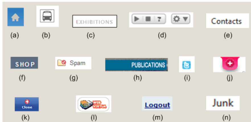
Fig. 2. A set of interface signs

The study found a total set of twelve ontologies to interpret the meaning of the interface signs. A few of them (i.e., number i , vi-viii , x , and xii ), as discussed in section 1.1, are also proposed by Speroni and Bolchini et al. in (Bolchini et al. 2009; Speroni 2006). The set of ontologies, their definition and examples are briefly presented in table 1.