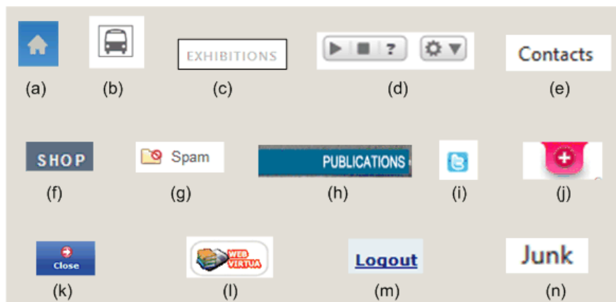
Fig. 2. A set of interface signs

The study found a total set of twelve ontologies to interpret the meaning of the interface signs. A few of them (i.e., number i , vi-viii , x , and xii ), as discussed in section 1.1, are also proposed by Speroni and Bolchini et al. in (Bolchini et al. 2009; Speroni 2006). The set of ontologies, their definition and examples are briefly presented in table 1.