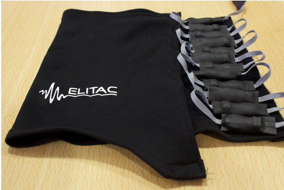
Fig. 3. The vibrotactile sleeve with 12 vibrationmotors

Vibrotactile sleeve. To generate the tactile sensation of the agent's touch we used an Elitac Science Suit. 1 The Elitac Science Suit is a modular system consisting of several eccentric mass vibration motors that can be attached to elastic bands of different sizes using Velcro. The intensity of vibration of each vibration motor can be individually controlled, with four levels of vibration intensity available. We attached 12 vibration motors to an arm-sized elastic sleeve, with approximately half a centimeter spacing between each motor, creating a high resolution tactile display (Figure 3).