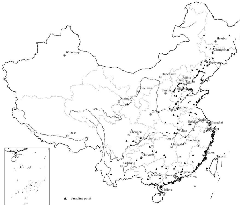
Fig. 1. Sampling points distribution map of 2008

Meteorological factors are provided by China Meteorological Data Sharing Service System, they are log data of 756 stations during peanut growth period. Process meteorological factors in Geostatistical Analyst module of Arcgis9.2 software, use ordinary Kriging method to calculate the spatial interpolation of meteorological factors at 756 points, and then use Extraction command to extract the data.