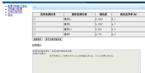
Fig. 3 Results of similarity match

When the similarity of case match is less than 0.75, after calculating by the rainbow trout feeding decision support system, all the results will be shown as Fig. 3.