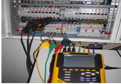
Fig. 1. Measuring Equipment - Power Analyzer in the Collection of Consumptions.

the power supply, for wear and tear or malfunction resulting from higher operating temperatures and lead to a rapid degradation.