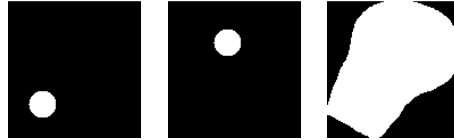
Fig. 4. A segmentation object containing two markers. Image processing “merged” the two nuclei into one segmented object.

In the remaining set of objects where the column sum equals one (and the row sum is greater than one, otherwise it would have been processed earlier) is the class of Merged , meaning more reference objects to a single measurement object. Conversely where only row sum equals one is labelled Split , assigned to the case where to one reference there are multiple measurement objects.