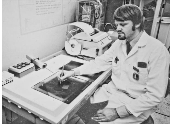
Fig. 2. The original man-machine radiotherapy interface with the Rho-Theta unit.

quality assurance from the early 1970s to late 1990s [7-13].