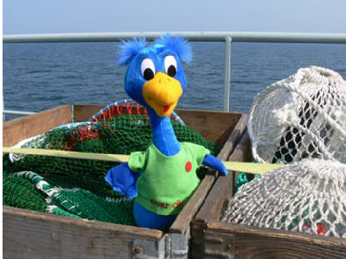
Fig. 3. The EMU toy animal participating in the Galathea3 expedition 2006-2007