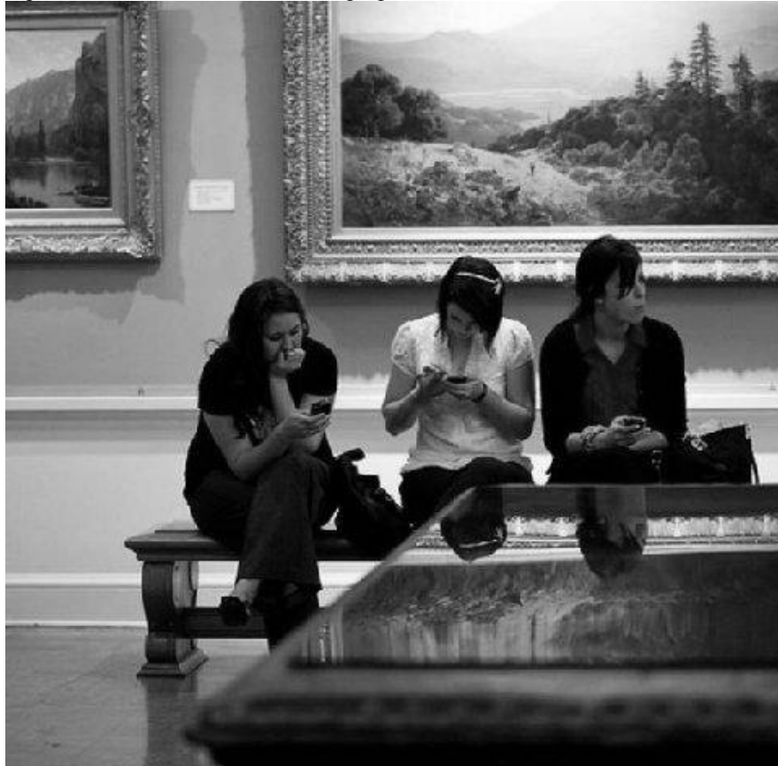
Figure 2: A museum visit: educational or social use of computers? 5

for the writing up of field work outside the classroom on return to the classroom, for example, from a museum, or for social purposes.