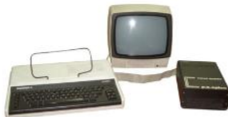
Figure 1: Elwro 800 Junior: microcomputer, screen, tape recorder

The most important feature of Junior, in particular for schools, was its operating system CP/J compatible with CP/M and moreover it could control the local network Junet consisting of up to 15 microcomputers Junior. ZX Spectrum could be also connected to the Junet network. A class configuration of Juniors consisted of a local network of students' Juniors with no disc drives, a teacher's Junior with an external disc drive which was a server of files and printers, and a printer. It was very economic and effective design – all students had access to discs and to printers.