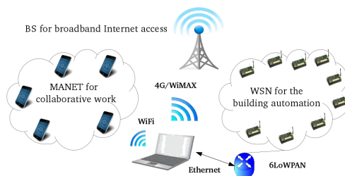
Fig. 1. Targeted use case scenario

ICN has potential features to welcome the heterogeneity of technologies that characterizes the IoT, but it has evidently not been designed to fulfill this objective. Therefore, we strive to enhance the design of current ICN solutions through the analysis of their deployment in scenarios where end-users join several networks at the same time. In figure 1 we illustrate one of the scenarios on target. We suppose to have an user with a laptop equipped with three different network interfaces. The user's laptop has an Ethernet interface plugged to a private company LAN. At the same time the user has joined a different ad-hoc WiFi network with some colleagues to do collaborative tasks. Finally, the user also has broadband Internet access, e.g., through either an usb-modem for cellular connection or PC-card for WiMAX access.