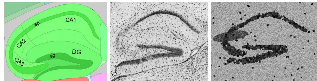
Figure 1: From left: regions in the hippocampus, a real and a synthetic image

A precise gene expression map, at the cellular and sub-cellular level, can provide crucial information for understanding the biological mechanisms that underlie the cellular and molecular events that take place in this structure. A promising data source to derive this map has recently been provided by the Allen Brain Atlas (ABA) [1], a huge, public database that contains high-resolution brain images mapping the expression patterns of most genes contained in the genomes of the analyzed organisms. Considering the wide availability of brain images containing morphological and functional information on the hippocampus in different organisms, it has become extremely important to design image analysis methods that may accurately, robustly, and reproducibly extract the hippocampus from them, in order to automatize any relevant analytic procedure.