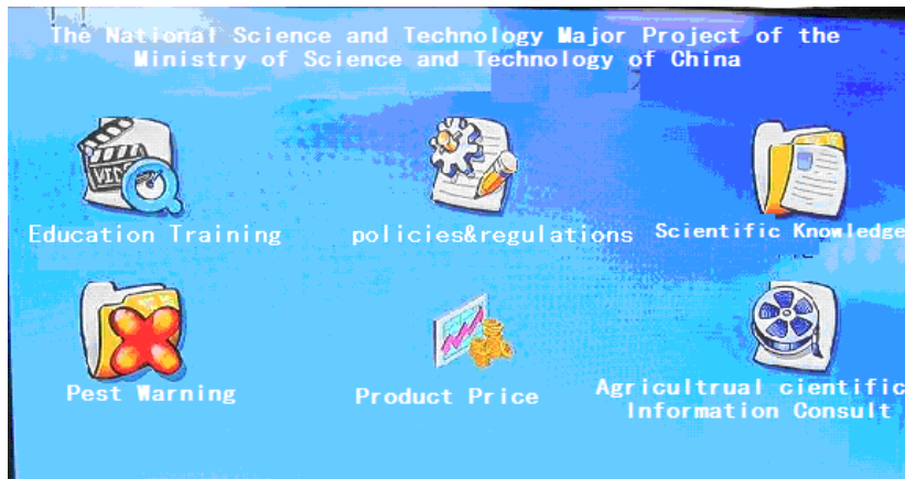
(b) The mobile terminal operation interface