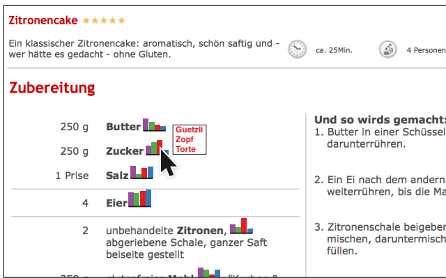
Figure 1: This sketch is an excerpt of a recipe from the flatmates' shared recipe notebook. Each ingredient is accompanied by a word-scale visualization depicting the number of recipes with that ingredient shared by other members of the group.

ing new menus. Each of the apprentice cooks has a notebook called recipes. All of them like to collect interesting recipes from their family and friends. Moreover, they enjoy browsing the Internet to find interesting recipes to add to their collection. The four flatmates created a shared digital notebook where they collect and share large numbers of recipes with each other.