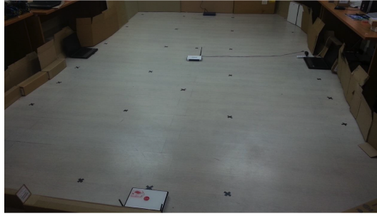
Fig. 2. Real scenario.

We placed the two hotspots in the points West and East of the area, the target in the centre of the area and at North and South we put the other routers. The reference scenario is represented by an area of 15m^2 ( 3 \times 5m ) as shown in Figure 2. The received power value has been obtained both from the anchor nodes (landmarks) and the target through the command Iwlist , that is available in the Linux platform as part of the wireless-tools library. Through this package, it is possible to have a set of commands to control the wireless devices based on the standard 802.11. The Iwlist command is used in combination with some parameters to better specify the data requested by a user. It details, for every detected network, a set of data related to the ESSID of the network, the quality of the signal, the transmission channel frequency, and the Received Signal Strength Indication (RSSI).