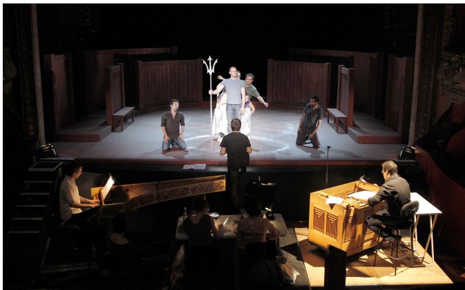
Figure 2: Rehearsal of the opera Elena , Festival d’Aix-en-Provence, 2013.

A performance rehearsal is a closed-door privileged moment where actors and director work in a protective intimacy that allows them a total commitment to their art. The idea of filming those moments of intimacy, moreover exhaustively, could cause discomfort at best, or even rejection at worst, from professionals considering as sacred the privacy of rehearsal. This aspect was taken into account in the design of the system, which was engineered to be minimally intrusive and maximally respectful of the creative process at work during the rehearsals.