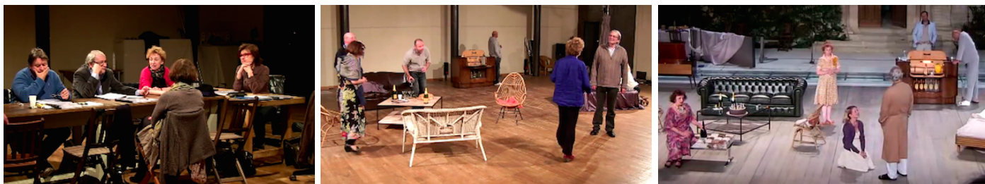
Figure 1: Three successive steps in the theater rehearsal process for Cat on a hot tin roof : (a) Table readings; (b) Early rehearsals in a studio; (c) Late rehearsals on stage (including dress rehearsals and technology rehearsals).

lens [5], [6], which makes it possible for researchers and amateurs alike to use the archive as stock footage , which they can re-frame and re-edit according to their own interpretation (this is described in Section V).