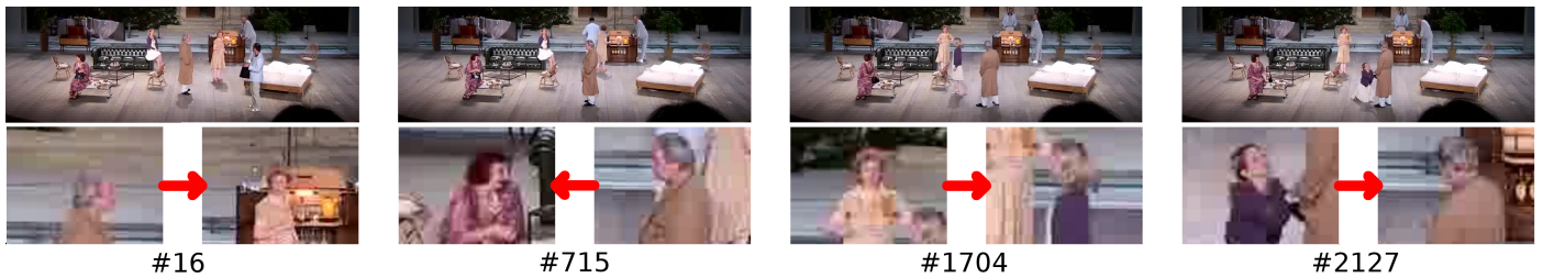
Figure 6: Reframing of the videos during dialogues. Audio-to-text alignment temporally localizes the actors speaking and being spoken to. Video tracking spatially localizes them on screen. This figure displays the automatic reframing process obtained for several frames on the sequence S_4 . The arrows go from the speaker to the addressee.

crew. Filming the rehearsals from the director's point-of-view was a key element for this positive response. In future work, we would like to increase the video resolution of the recordings to 4K in order to better exploit the capabilities of our virtual zoom lens; and to experiment with stereoscopic 3D and 360° panoramic video which would allow to include reverse shots of the directors and their assistants, which are currently not recorded.