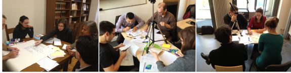
Figure 1: The three participatory design sessions held.

three different user groups (Fig. 1): WWI historians, librarians and medievalists. We expected these to have different interests, practices and goals of research. The aim of these sessions was to understand how different user groups would want to search, browse, and visualize (if at all) information from archival research. In total we had 49 participants (14 in the first, 15 in the second and 20 in the third).