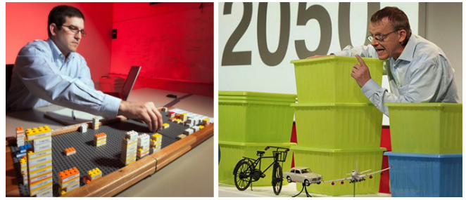
Figure 2: Manually-updated physicalizations used by an automotive engineer (left, image © General Motors) and by Hans Rosling during a public talk (right, image © TED).

To further illustrate the potential of data physicalizations, we provide three usage scenarios which are fictional and to a large extent ignore current technological limitations.