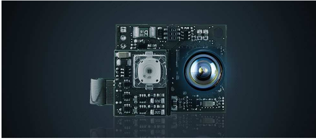
Fig. 1: The Camboard nano

six hand gestures. While the results remain unclear, except for the fact that gestures could be well accepted as a means of control in a car, the gesture set remains small and the effect of different lighting conditions on the results is not discussed. More comprehensive overviews are given in [11] and [12].