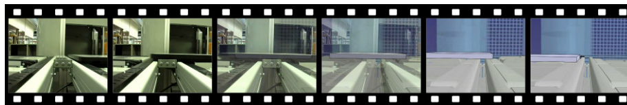
Fig. 3. Mapping operations in the real world to the virtual world using SoA-based real and virtual smart devices.

Thanks to the high-level nature of the services provided by the smart devices, the device operations have a one-to-one mapping between both the real and virtual worlds, meaning that as long as all the devices are accessible in the network, the same controller is able to perform the same set of operations in the virtual and real worlds without the need for any specific platform dependencies. Fig. 3 shows an example of this mapping during a transfer operation from one smart device to another.