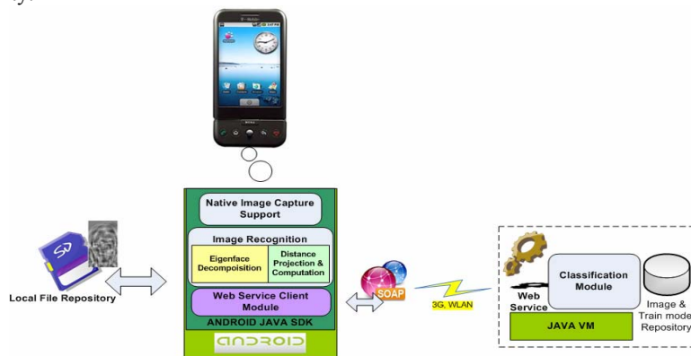
Fig. 2. Architecture of the proposed mobile face recognition system.

The mobile face recognition system has been developed utilizing Google's Android mobile Operating System (OS) [15] and the appropriate software development kit (sdk). Android is a mobile operating system running on the Linux kernel. Several mobile device vendors already support it. The platform is adaptable to larger and traditional smart phone layouts and supports a variety of connectivity technologies (CDMA, EV-DO, UMTS, Bluetooth, and Wi-Fi). It supports a great variety of audio, video and still image format, making it suitable for capturing and displaying images. Finally, it supports native multi-touch technology, which increases the application's usability.