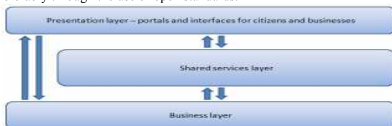
Figure 1: Generic government ICT architecture

Even though the Norwegian architecture has been designed in a national context, its overall principles are based on a service-oriented framework, heavily influenced by the work in Denmark and other countries. Its overall, layered structure is illustrated in figure 1. The business layer at the bottom consists of the different government agencies and their ICT solutions. The middle layer provides shared services that may be relevant to many or all eGovernment services, such as an identification and authentication solution, etc. in order to enable the reuse of ICT-services (DIFI 2009). The presentation layer at the top enables citizens and businesses to interact with the electronic services provided by the different government agencies. This layered structure makes it much more flexible and robust with respect to future changes in the different layers, since a change in one layer will not impact on another layer. This assumes that the layers are loosely coupled and that they make use of open and standardized interfaces, preferably through the use of open standards.