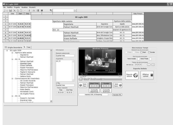
Figure 4: VIEW Indexer - main interface