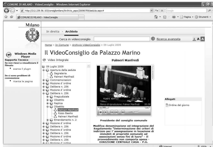
Figure 2: The layout of the main page of VIEW

As shown in Figure 2 and Figure 3, the main application layout for citizen's interface is based on three panels. They are framed by a rectangular area on the top (for the main navigation and the search engine) and a lateral grey part, which are due to the Institution communication style guidelines. The left panel contains the meeting agenda represented as a tree of topics, nested subtopics and speakers' names. Each speaker (i.e. each leaf of the tree) is linked to the corresponding speech (audio/video fragment), displayed in the upper part of central panel, while in the bottom part, minutes and short descriptions are visualized, if available. The related documentation (like the planned agenda, the .pdf documents) is visualized at the bottom of the right panel. The upper central bar is for breadcrumb trails, status information and archive searching. Figure 3 shows the result of a "simple research". The left hand panel has been substituted by a speeches' list coming from the search engine while the upper part of the right panel contains a set of fields for search refinement.