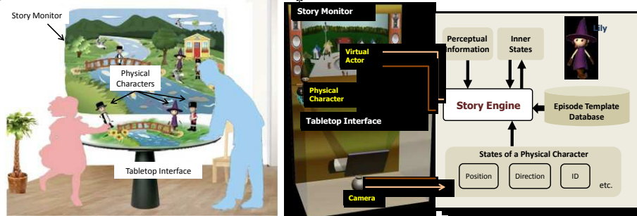
Fig. 1. System Concept Image and System Configuration

2 Takashi MORI†, Katsutoki HAMANA††, Chenchen FENG†† Jun'ichi HOSHINO††