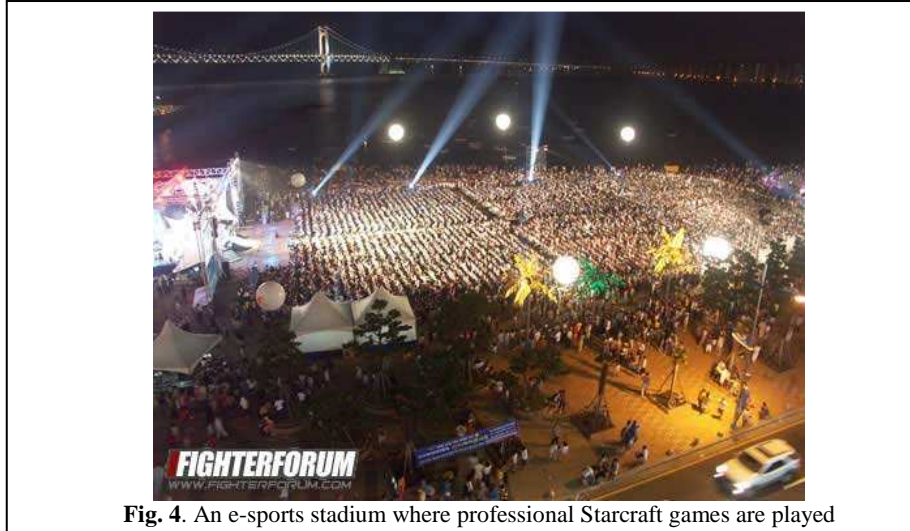
Fig. 4. An e-sports stadium where professional Starcraft games are played

Many publishers now provide players with an engine for generating game content. In the case of Starcraft, the generation engine allowed players to not only create new game maps but it allowed them to modify the fundamental rules of the game. With this new ability, players became level designers and co-authors of the game. Due to the popularity of the Starcraft map editor, the game publisher followed up with another more powerful system with the release of the game Warcraft III,