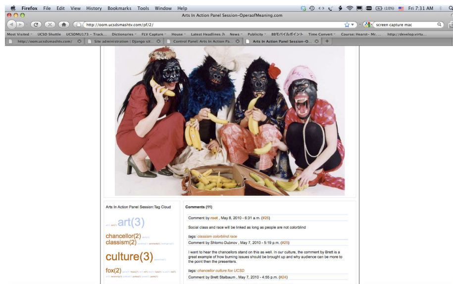
Figure 2. An example screen of OoM for an event regarding Art Activism

An example of the screens and comments generated by OoM are given in Figure 2. This is one of multiple pages that were running during a panel session in the Theater Department in UCSD on activism in the arts. The central image represents a theatrical group called “Guerilla Gilrs”, and it was brought up to demonstrate an example of feminist art activism, embedded from the web after searching for contents related to the topic of the main presentation [art activism, theatre, feminism]. The lower half of the screen shows the audience chat on the right and a dynamic text cloud on the left. Each one of the display elements comprises a separate object in the OoM system.